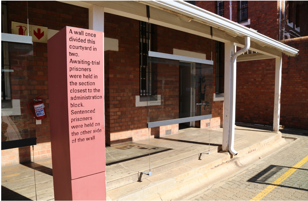
Left. A simple plaque commemorates the former Awaiting Trial Block.