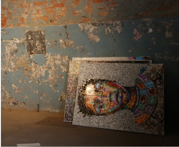
Above. The Old Fort Prison now includes a temporary exhibition space.

townships around the city disappeared into Number Four for a period of time,” 4 noted Segal.