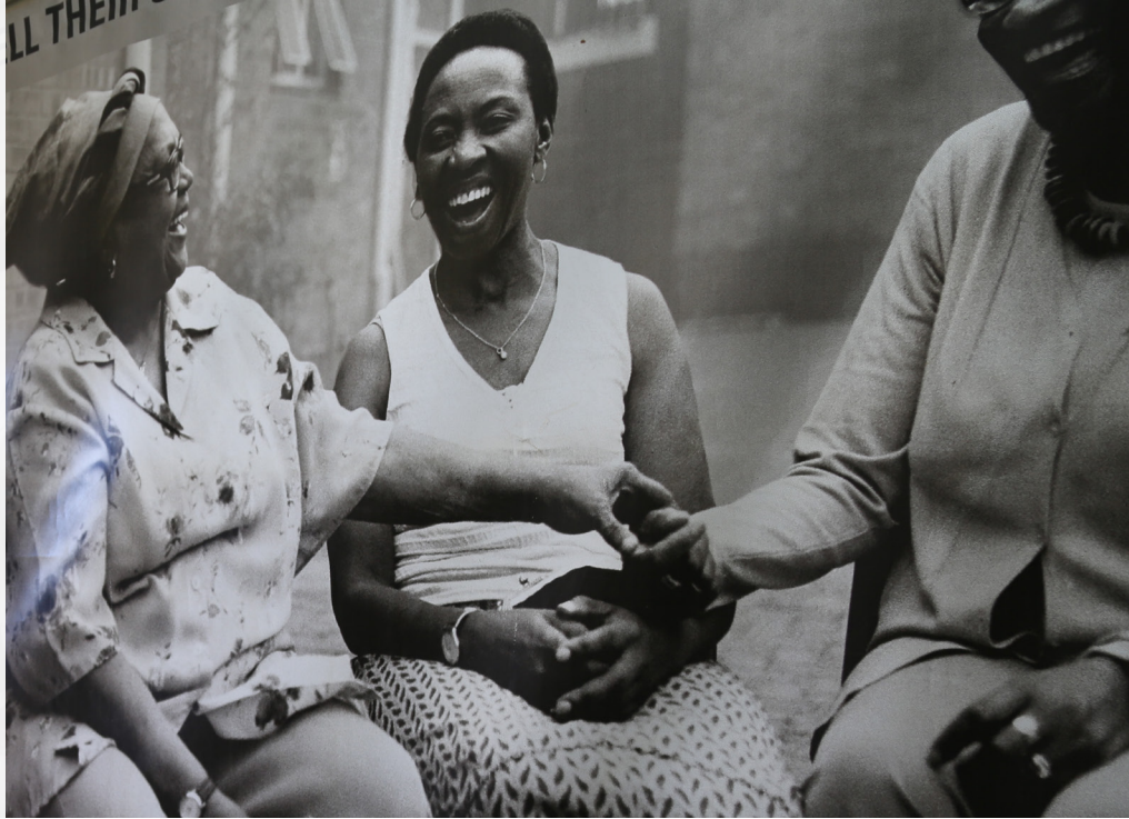
Above. The museum's exhibits juxtapose heroic anti-apartheid narratives with the experiences of ordinary people. This exhibit depicts female political prisoners who returned to the site to share their experience in the Women's Jail.

The goal of the precinct was to create a link between the past and the future through three interrelated missions: connect the Constitutional Court to historic sites of pain; preserve, conserve, and restore history on the site; and use the site to spur urban regeneration.