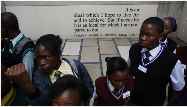
Above. A group of students visiting the precinct pause in front of a quote from Mandela.

schools in other provinces in South Africa seldom visited the site. Fhatuwani Rambau, education and public programs coordinator at Constitution Hill, reported that the site expected over 175,000 visitors in 2016, but other respondents remain doubtful that the precinct can continue to pull in substantial visitors without additional investment.