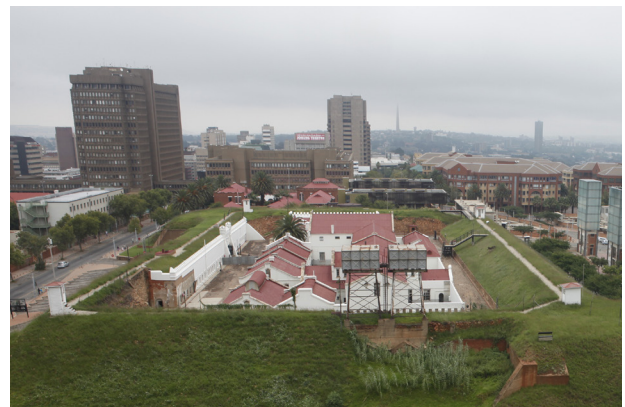
Above. An aerial photograph of the precinct from the east. The precinct is intended to preserve history and attract commercial investment.

In total, ZAR469 million in public funding was made available to support the development of the Constitutional Court. However, the additional estimated ZAR416 million needed to “complete [the] commercial, residential, and heritage, education, and tourism components of the development” 1 was unavailable due to the nation’s lower political priority for these components.