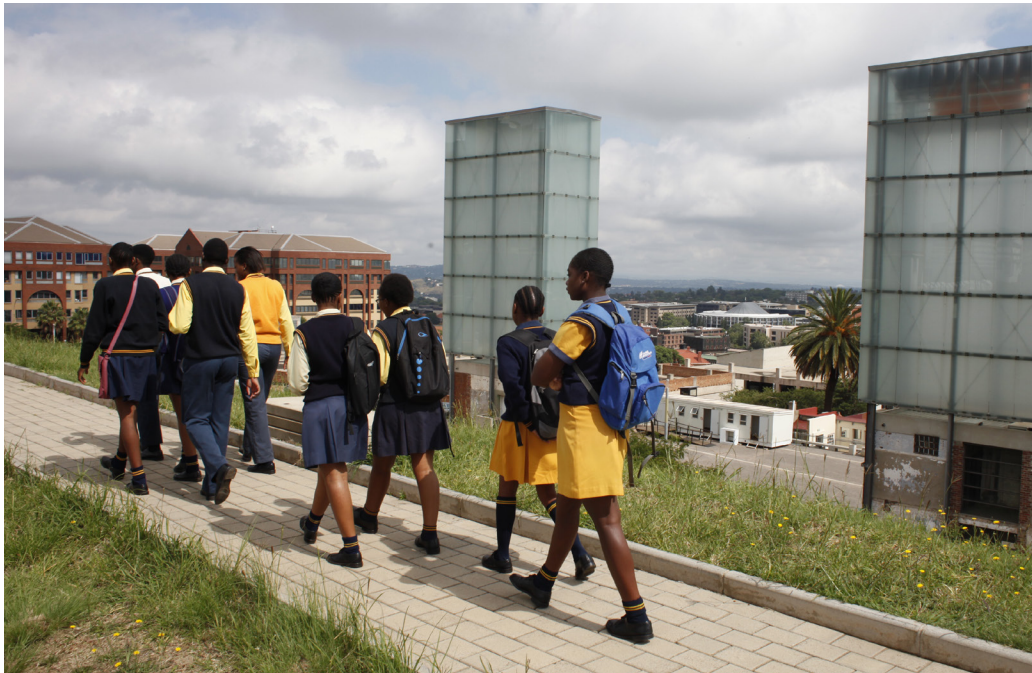
Below. A group of students attending an outreach program at Constitution Hill walk the ramparts of the Old Fort.