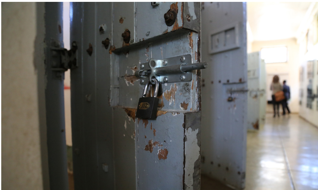
Left. The exhibit design in the Number Four Prison allows visitors to experience history authentically and directly.

To turn the Constitution Hill precinct into a heritage site, Ochre focused on creating a multidimensional visitor experience through the preservation, conservation, and restoration of a historic place. According to a project curator, the museum that was to be created in the Old Fort Prison should relate to a variety of visitors: from the Justice whose “interrogation of issues is always informed by the past,” to the “person who agreed with or was complicit with apartheid,” to the young person who “can’t believe that this took place here.” The museum exhibits would include a variety of voices and perspectives in presenting how apartheid affected an entire culture—speaking to diverse audiences and addressing the urgent need to advance peace and reconciliation for the country. This represented a major departure in approach, as heritage was traditionally presented in South Africa through top-down curation, relying primarily on the voice of experts and colonial modes of communication within museums.