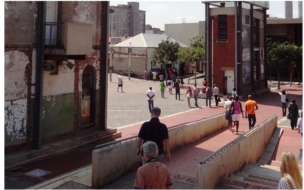
Above. Visitors tour the Constitution Hill Precinct.

To allow this expression, the exhibit design features would be subtle, so viewers could experience history authentically and directly through evidence and testimony. One designer explained, “We didn’t want